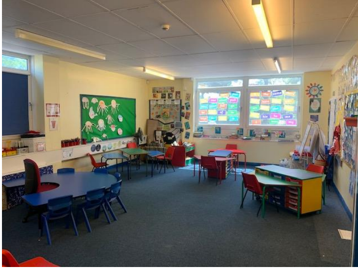
Reception Red Group Classroom