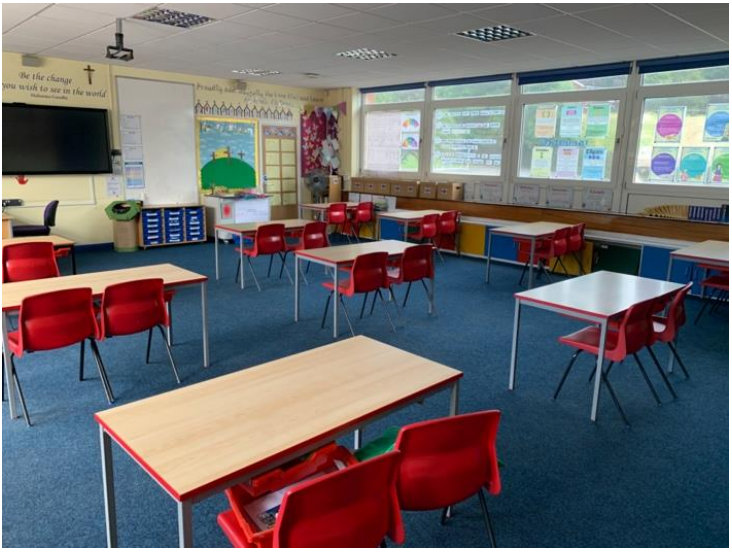
Key Stage 2 Key Worker Green Group

<u>PLEASE NOTE: Once we have reached our capacity for number of children attending school, we</u> <u>will no longer be able to take more children in. Our capacity is 70 children in total in school, as</u> <u>we have 7 classrooms, there will be 10 children in each classroom.</u>